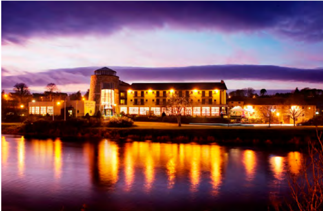
The Riverside Park Hotel located on the banks of the River Slaney.