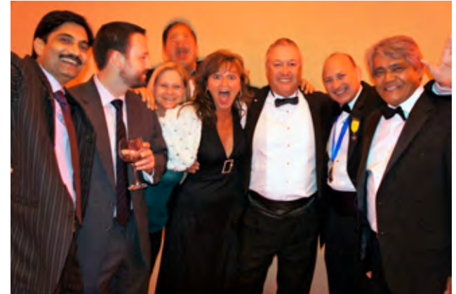
The gang at the Gala

members that were present and encourage them to join CII.