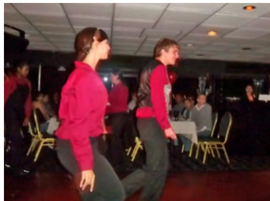
The entertainment made CII members want to get up and dance.

There was a well-attended "Duck Tour;" a tour of Boston in a WWII-style amphibious landing vehicle and lots of laughs in the CII suite during evening hours. Rumor has it that hotel security was dispatched to sequester the noise emanating from our suite. We all know whose fault that was! ☐