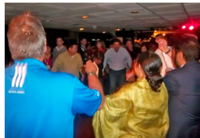
And CII members did dance!!!!!!