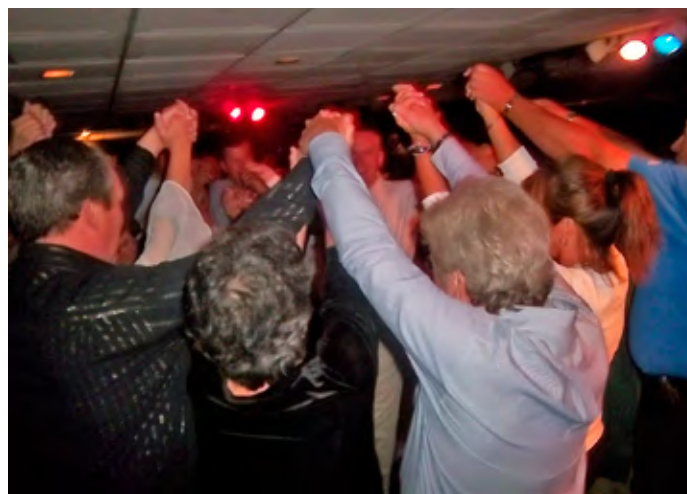
And to celebrate our organization by joining hands