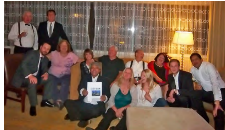
CII members celebrate the last night at the Hospitality Suite!!