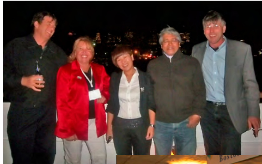
Others weathered the wind on the second floor...with a view of Boston