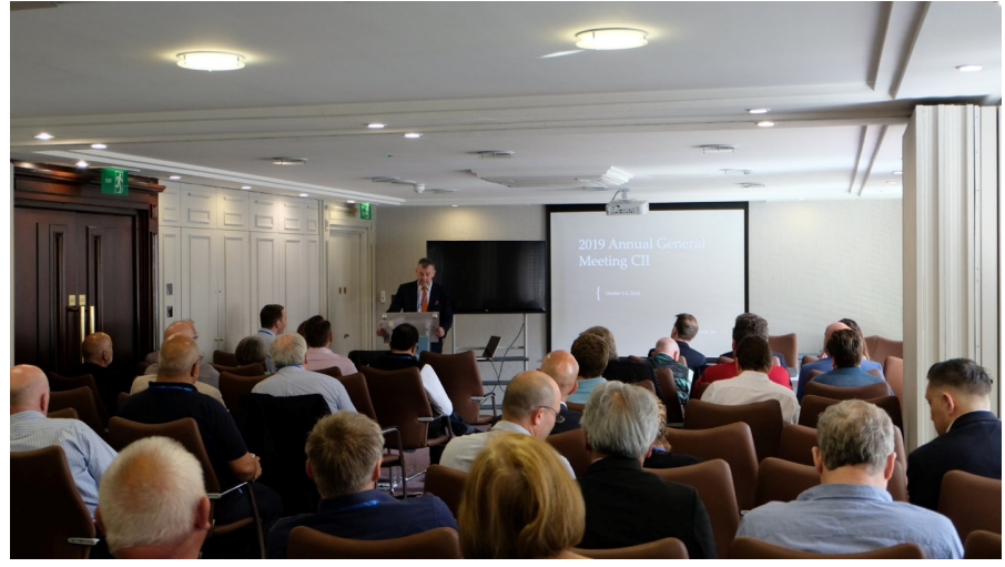
Not all fun and games -serious seminar in session.