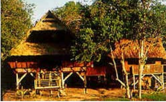
Timberhead Tropical Adventure