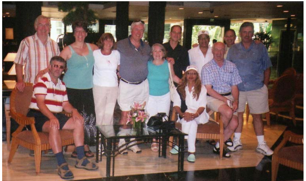
Some of the gang in Singapore