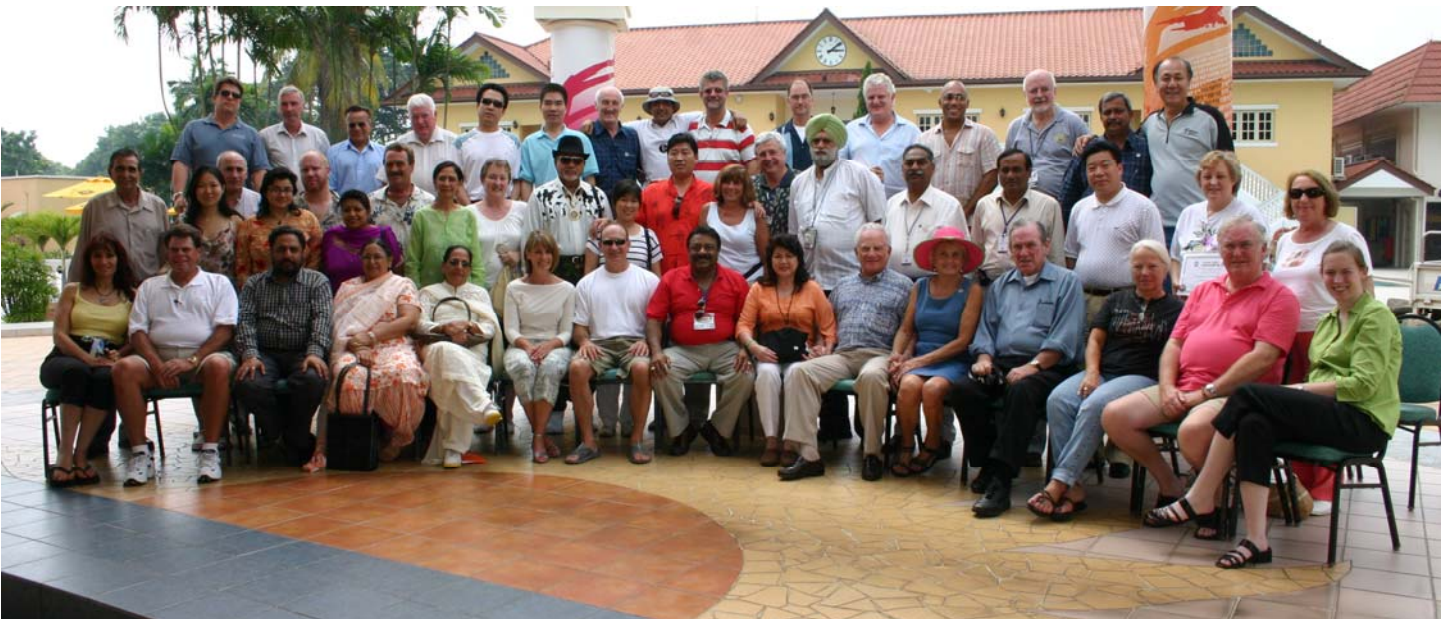
Lunch over and a few cold beer to stave off the heat wave, the group posed for posterity at the Temasek Club.