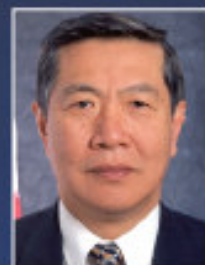
Dr. Henry Lee Of Court TV's Forensic Files and Trace Evidence: The Case Files of Dr. Henry Lee