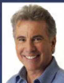
John Walsh Keynote A.M. Speaker Host of America's Most Wanted