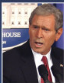
Mr. President Keynote Luncheon Speaker Photo opportunity for PI Magazine Subscribers