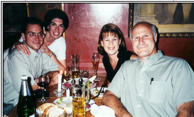
Be first to identify these spouses and win a commemorative coin!

realize my particular vision for any particular moment. We certainly all see the benefit of using the Internet as a valuable resource for communicating with the outside world, and researching what we need to know, now rather than later. But, as an investigator I saw that with available technology I could conduct