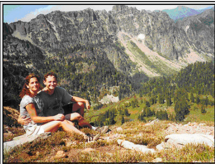
The happy couple...