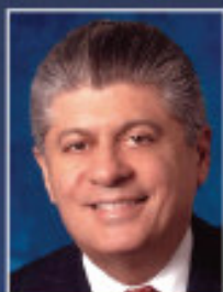
Andrew Napolitano "Judge" Opening Speaker Judicial Analyst, Fox News

The Largest Educational and Networking Investigative Conference Ever Held!