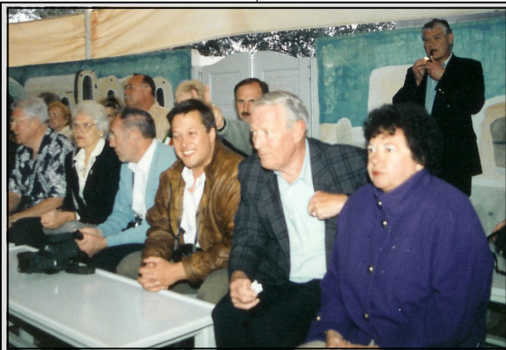
CII Seminars are informational and fun!

International Investigators. The current position of Treasurer for the Council of International Investigators requires more oversight of the Councils finances then