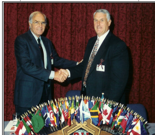
CII Seminars are informational and fun!

surveillance, photograph a subject with a digital camera, dictate my report directly into a laptop, process my photos and include them in the report. I could then dial my Internet provider by cellular modem and e-mail my report to the client in two hours. It would give me a competitive edge. It would save time. It would save money. But it isn't even necessary to do all this.