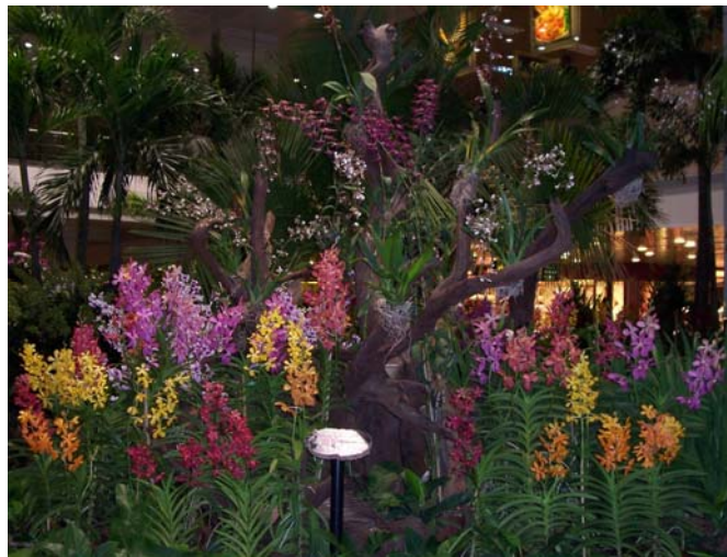
Orchid display at Singapore Airport

This year, the ASIS Annual Seminar & Exhibits will be held in Las Vegas, USA from September 24 th to 27 th , 2007.