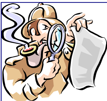
Always read the fine print!

your company , you create an exposure protected only by non-owned and hired auto coverage. Example: involvement in a vehicle accident while working. Your personal auto policy will defend you, but not your business.