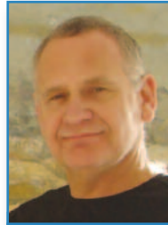
Jacob Lapid Israel